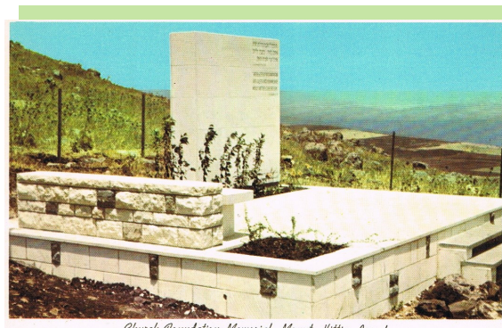
Church Foundation Memorial, Mount Hittin, Israel

To whom coming, as unto a living stone, disallowed indeed of men, but chosen of God, and precious, Ye also, as lively stones, are built up a spiritual house, an holy priesthood, to offer up spiritual sacrifices, acceptable to God by